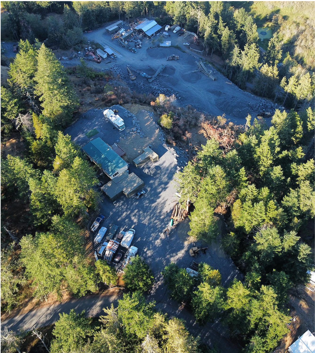
This is an overview of the Egg lake Quarry and the residential parcel noted here.