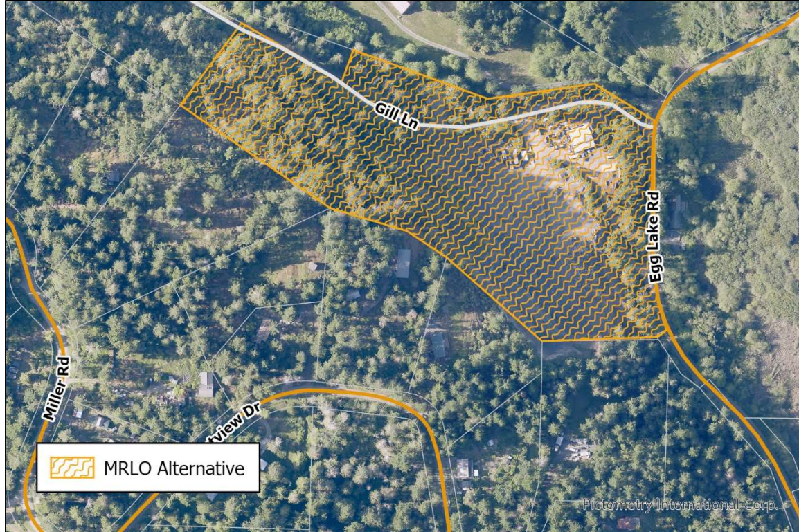
Map 1. Staff Alternative MRLO Designation for Egg Lake Quarry.

Amending the proposed MRLO as shown in Map 1 should address the concerns of both the applicant and the neighboring property owners. Limiting the MRLO to the existing quarry can address the neighbor's concerns about the quarry expanding into the neighboring subdivision while also designating the existing quarry as mineral resource land.