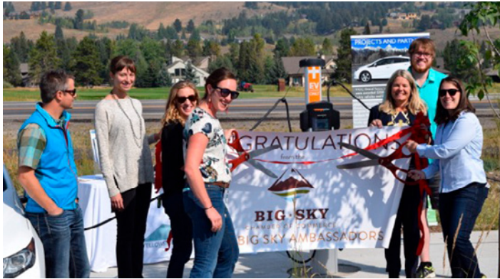
NATIONAL DRIVE ELECTRIC WEEK IN BIG SKY, MONTANA

Electric Auto Association and locally by many other partners, allow people to organize their own pro-EV events that could include parades, an EV showcase at existing festivals, or just events where people are able swap EV stories with neighbors at a driveway party. The best events include opportunities for test drives as well as for public officials to attend and announce new EV policies.