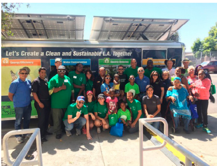
NATIONAL DRIVE ELECTRIC WEEK IN WATTS, CA. 2016.

California: SB 350 was signed by Governor Brown