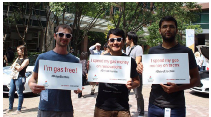
THREE NATIONAL DRIVE ELECTRIC WEEK ATTENDEES AT TECH SQUARE IN ATLANTA SHOW WHY THEY DRIVE ELECTRIC.

This Toolkit makes it clear that we need an all-hands-on-deck effort from government, utilities and transit agencies, and it lays out a full range of actions and policies that are proven to accelerate EV adoption, both effectively and equitably, in any state and local community that wants cleaner vehicles and cleaner air.